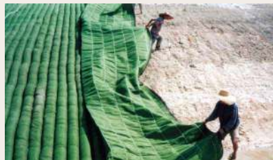
Laying Geotube® Sand Filled Mattress over prepared slope.

The Sand Filled Mattress is delivered in rolls which can be easily transported to site. Laid with parallel tubular sections running down the slope, each are hydraulically filled with sand through the top openings. The sand is introduced through a small hopper and washed down with water pumped from the waterway or impoundment. Adjacent rolls of Sand Filled Mattress are joined by seaming on site. Finally, the Sand Filled Mattress is anchored in a trench at the top of the slope.