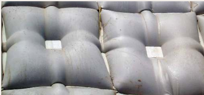
Typical close up of Geotube® Concrete Mattress.

Alternatively, a hybrid system with concrete cellular sections that contain soil and vegetation within the cells can give a softer appeal. TenCate Geotube® Concrete Mattress Systems are economical and can be easily installed at site. They are ideal solutions for areas with poor accessibility and handling of precast concrete units and rip-rap.