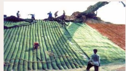
Geotube® Sand Filled Mattress hydraulically with sand.