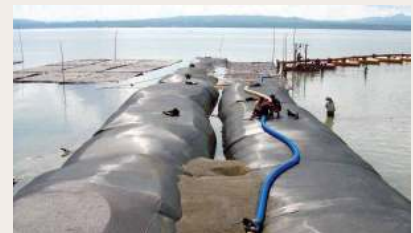
Geotube® Dyke for lakeshore reclamation.