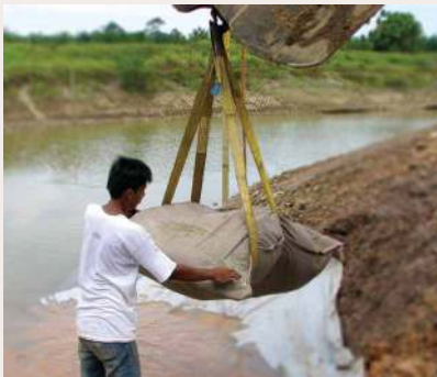
Lifting and positioning Geobag unit.

TenCate Geotube® Geobag units are manufactured from engineered fabrics combined with high capacity seams to produce bag or pillow shaped containers. When filled with sand or other soils, the bags are used as basic armour units for erosion protection works. They are engineered to provide strength, durability and soil tightness to perform during installation and during the operational life. They come in a wide variety of sizes and shapes that can suit practically any site handling conditions. TenCate Geotube® Geobag units are site-filled, closed and placed using standard construction equipment. They are easy to use and can be rapidly mobilised if necessary for emergency works. They are either lifted into position or dropped into water. TenCate Geotube® Geobag Systems are very versatile; they are used to construct revetments and other hydraulic structures, including filling of scour holes and closing of breached dykes.