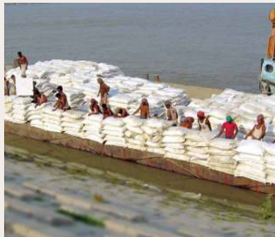
Deploying Geobag units by dropping into water.