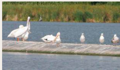
Geotube® Dyke for wetland engineering.

TenCate Geotube® Dyke Systems utilise locally available sand for the construction of dykes in waterways and impoundments. The Dyke Systems either reduce the use of rock or completely replace rock as material for construction of dyke structures. TenCate Geotube® Dyke Systems are ideal for use as river training dykes, reclamation dykes and dykes for water control. They are more economical and often have lower carbon footprints than the rock dykes they replace.