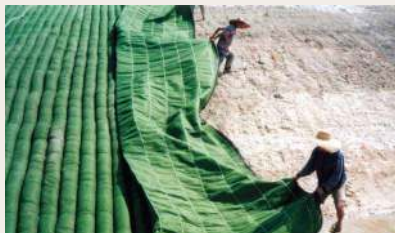
Laying Geotube® Sand Filled Mattress over prepared slope.

The Sand Filled Mattress is delivered in rolls which can be easily transported to site. Laid with parallel tubular sections running down the slope, each are hydraulically filled with sand through the top openings. The sand is introduced through a small hopper and washed down with water pumped from the waterway or impoundment. Adjacent rolls of Sand Filled Mattress are joined by seaming on site. Finally, the Sand Filled Mattress is anchored in a trench at the top of the slope.