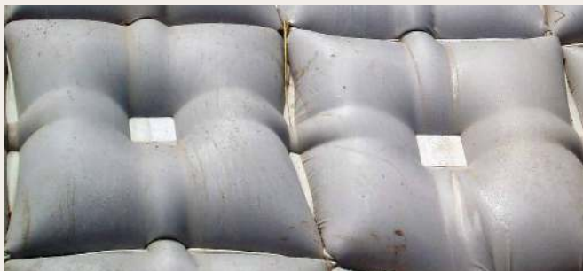
Typical close up of Geotube® Concrete Mattress.

Alternatively, a hybrid system with concrete cellular sections that contain soil and vegetation within the cells can give a softer appeal. TenCate Geotube® Concrete Mattress Systems are economical and can be easily installed at site. They are ideal solutions for areas with poor accessibility and handling of precast concrete units and rip-rap.