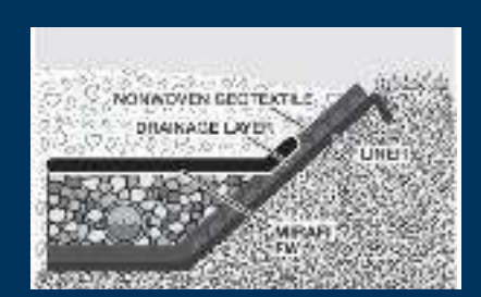
Leachate Collection System