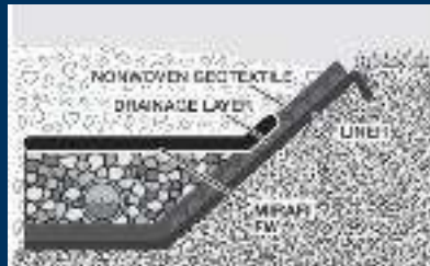
Leachate Collection System