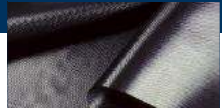
Mirafi® FW Woven Geotextile

BANK STABILIZATION / ROCK (ARMOR) UNDERLAYMENT Geotextile Placement Place the geotextile in close contact with the soil, eliminating folds or excessive wrinkles